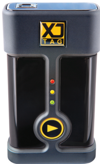
Available in black and yellow.*